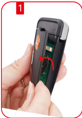
1 Push the slide button to separate the shell

First use or when the battery runs out need to change new battery, following steps: