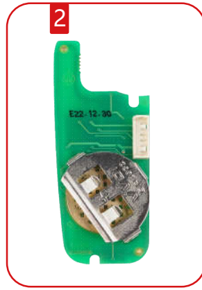
Take the battery out and replace new one