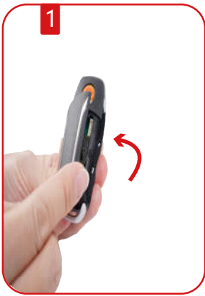
Break open the back side plastic cover to open the remote

First use or when the battery runs out need to change new battery, following steps: