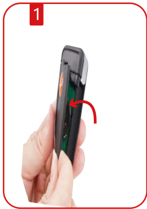
Break open the back side plastic cover to open the remote

First use or when the battery runs out need to change new battery, following steps: