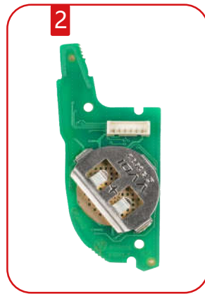
Take the battery out and replace new one