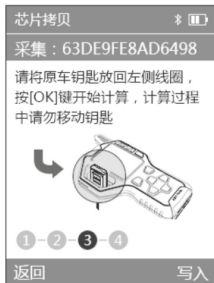
Picture 2.5 Data acquisition success diagram