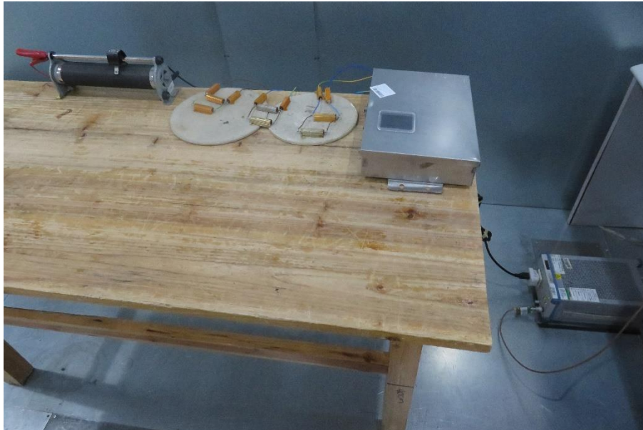
Radiated Emission (Below 1GHz)

Note: EUT is positioned at the center of the turntable to keep 3 m between the measurement antenna and EUT for the radiated emissions measurements Conducted Disturbance