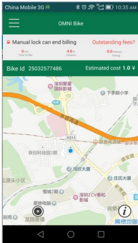
开锁用车页面 unlocking and using bike page