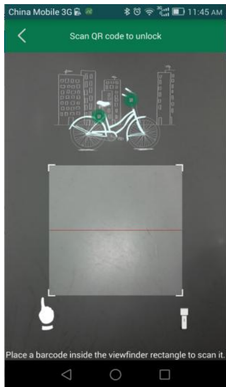
scanning QR code page