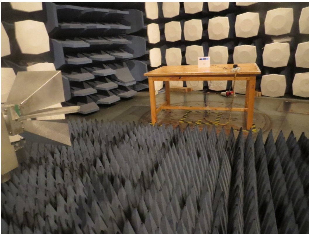
b: Above 1GHz