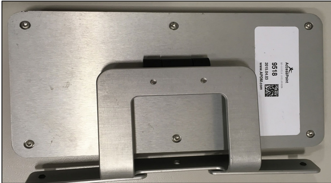
Figure 1: Location of AP-V1 label

The label for the Access Point (“AP”) is printed and affixed to the back of the case.