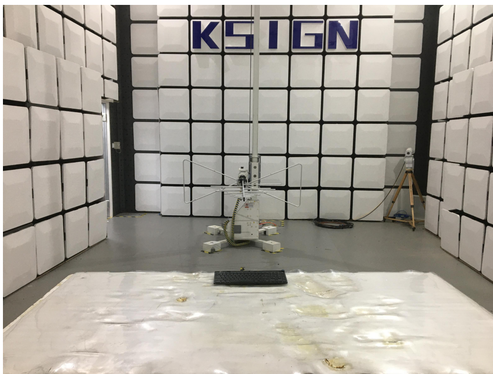
Radiated Measurement (Above 1GHz)