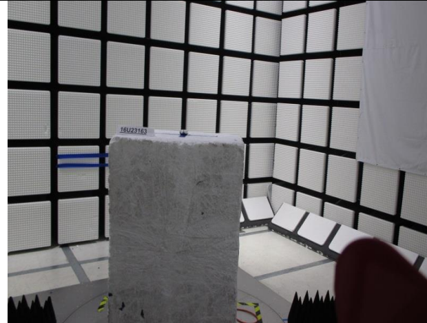
RADIATED FRONT PHOTO (ABOVE 1 GHz)