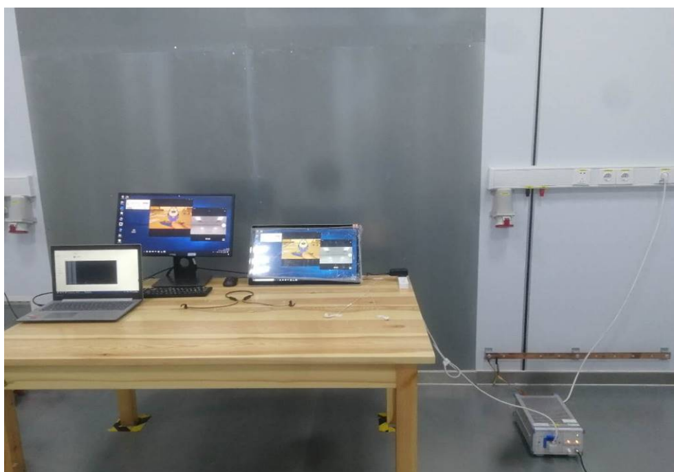
Fig. 4 Power line conducted emission setup photo