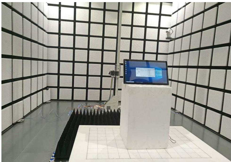
Fig. 3 Radiated emission setup photo(Above 1GHz)