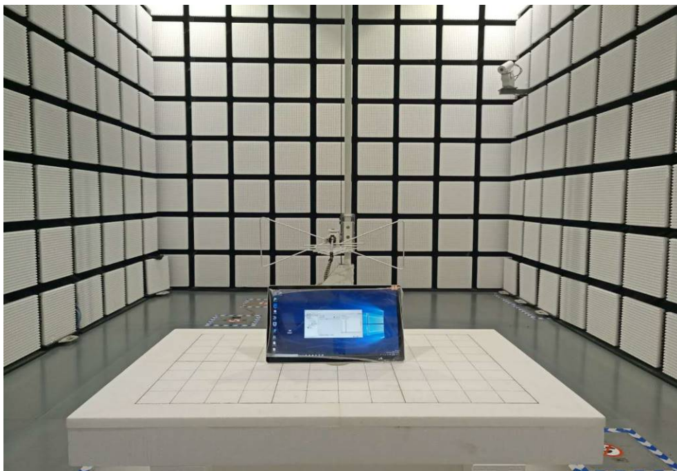
Fig. 2 Radiated emission setup photo(30MHz-1GHz)