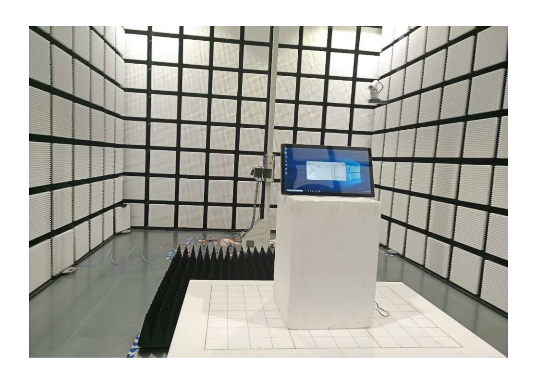
Fig. 3 Radiated emission setup photo(Above 1GHz)