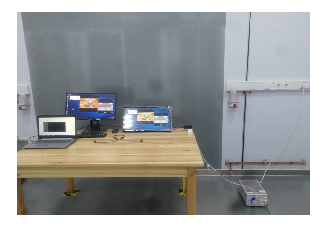
Fig. 4 Power line conducted emission setup photo