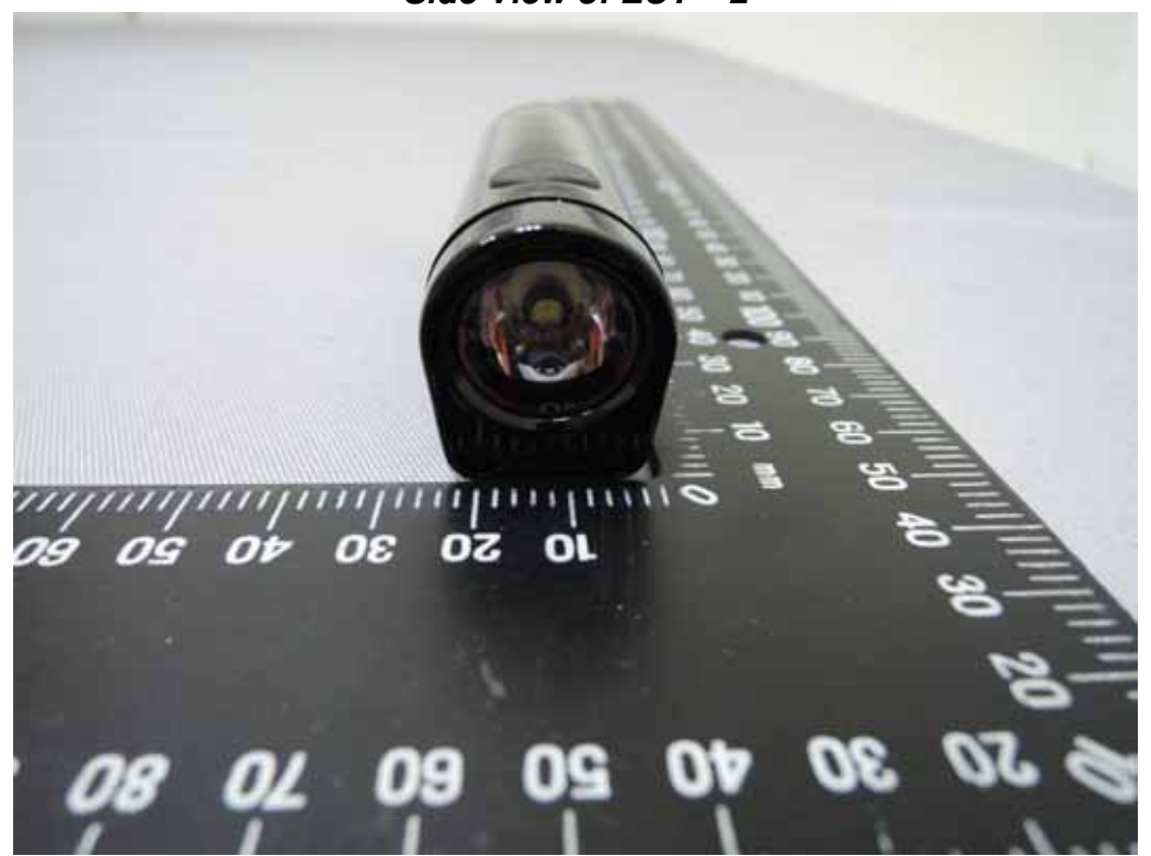
Side View of EUT - 3