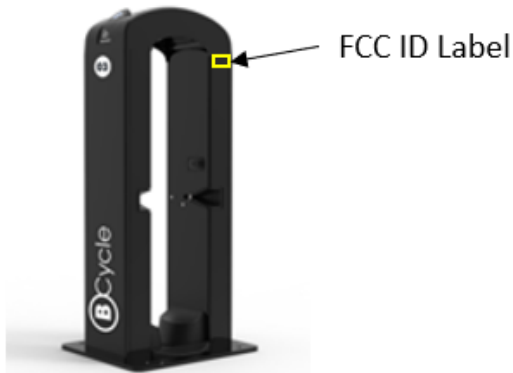
Application 5273582 in stand-alone bike docks