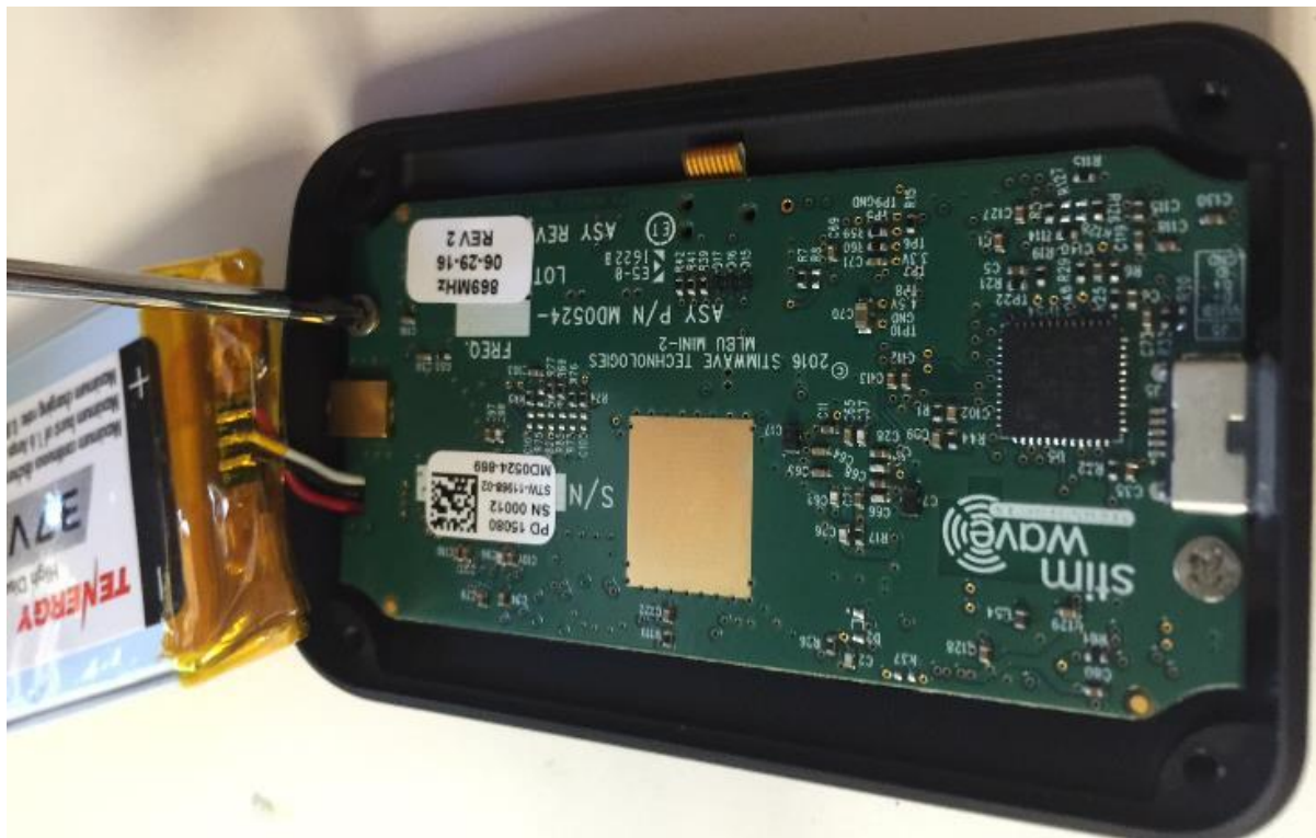
Figure 3. Bottom Side of the PDBT-2 Circuit board