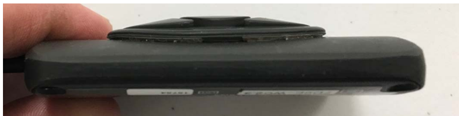
Figure 5. Left Face of the PDBT-2