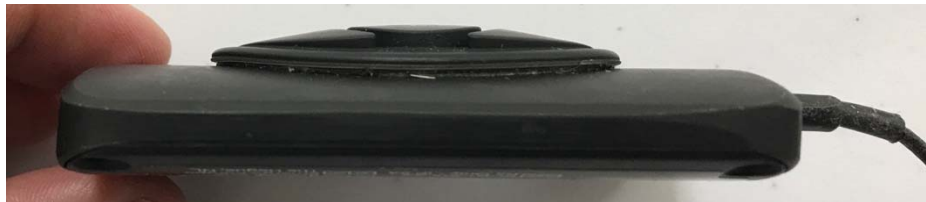
Figure 4. Right Face of the PDBT-2