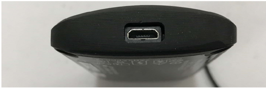
Figure 3. Bottom face of the PDBT-2