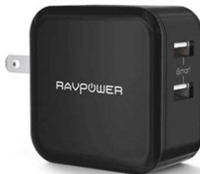
Figure 6. Image of the USB Wall Plug used in the PDBT-2 System.

The PDBT-2 has one accessory, a wall-plug. Shown in Figure 6.