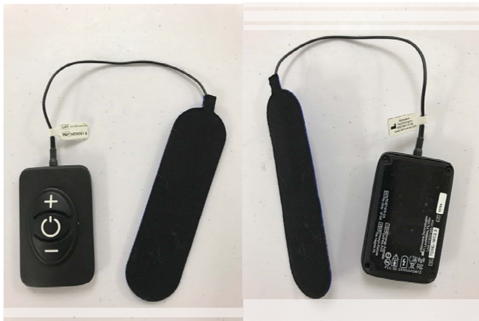
Figure 1. (left) Front side of PDBT-2. (right) Back side of PDBT-2.