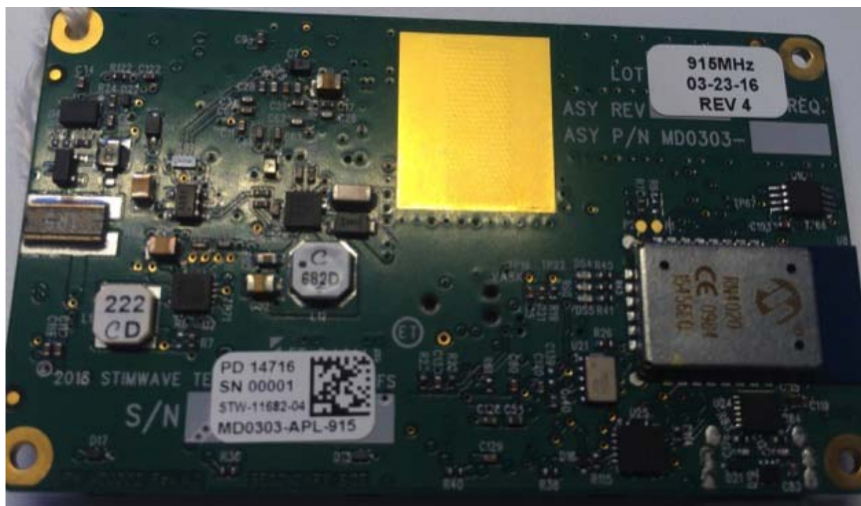
Figure 3. Top Side of the LBRD-2 Circuit board