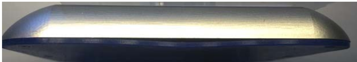
Figure 3. Bottom face of the LBRD-2