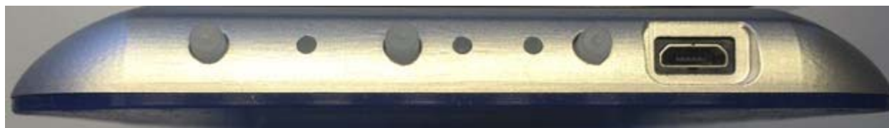
Figure 2. Top face of the LBRD-2