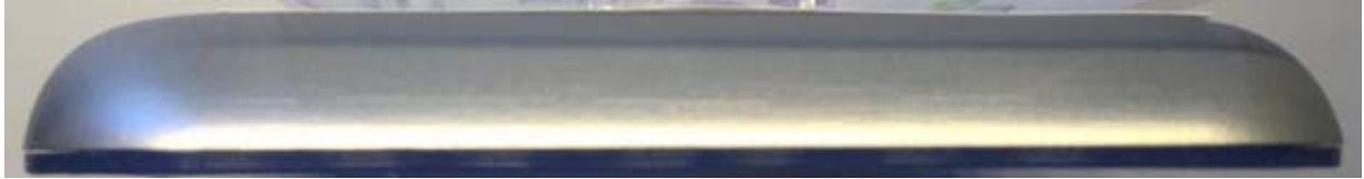
Figure 5. Left Face of the LBRD-2