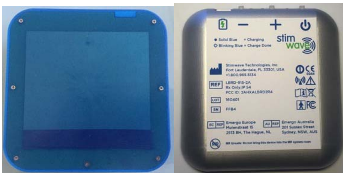
Figure 1. (left) Front side of LBRD-2. (right) Back side of LBRD-2.