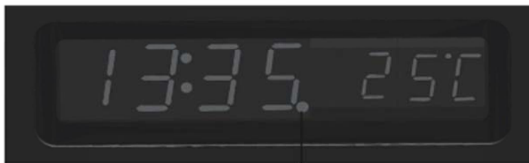
ALARM clock function

Press SNOOZE key to adjust the brightness under non-alm status.