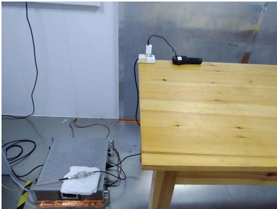
Test Photo 1