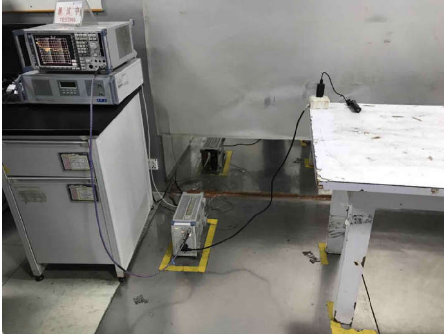
Conducted Emissions Test Setup