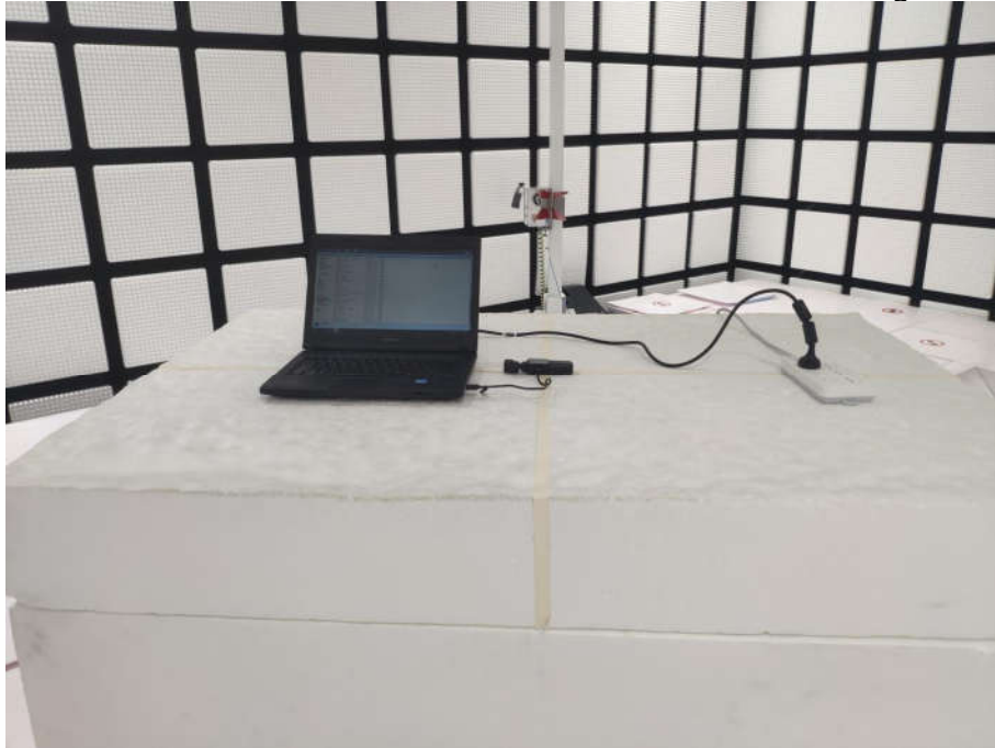
Radiated spurious emission Test Setup-3(Above 1GHz)