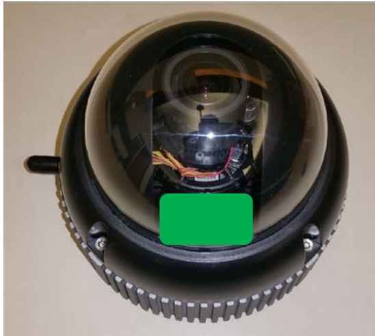
(a) EUT with clear dome installed