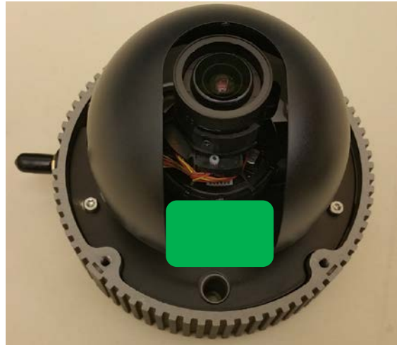
(b) EUT with clear dome removed