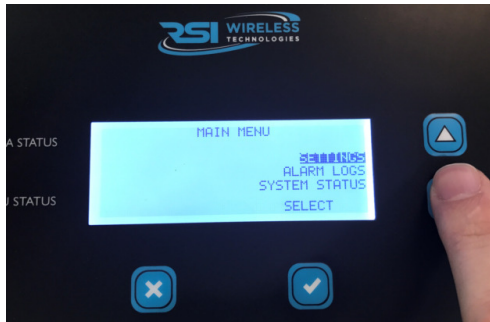
Figure 3 – Main Menu