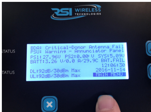
Figure 2 – System Status

Power limit needs to be set for both the uplink and the downlink amplifiers.