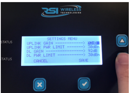
Figure 4 – Settings Menu