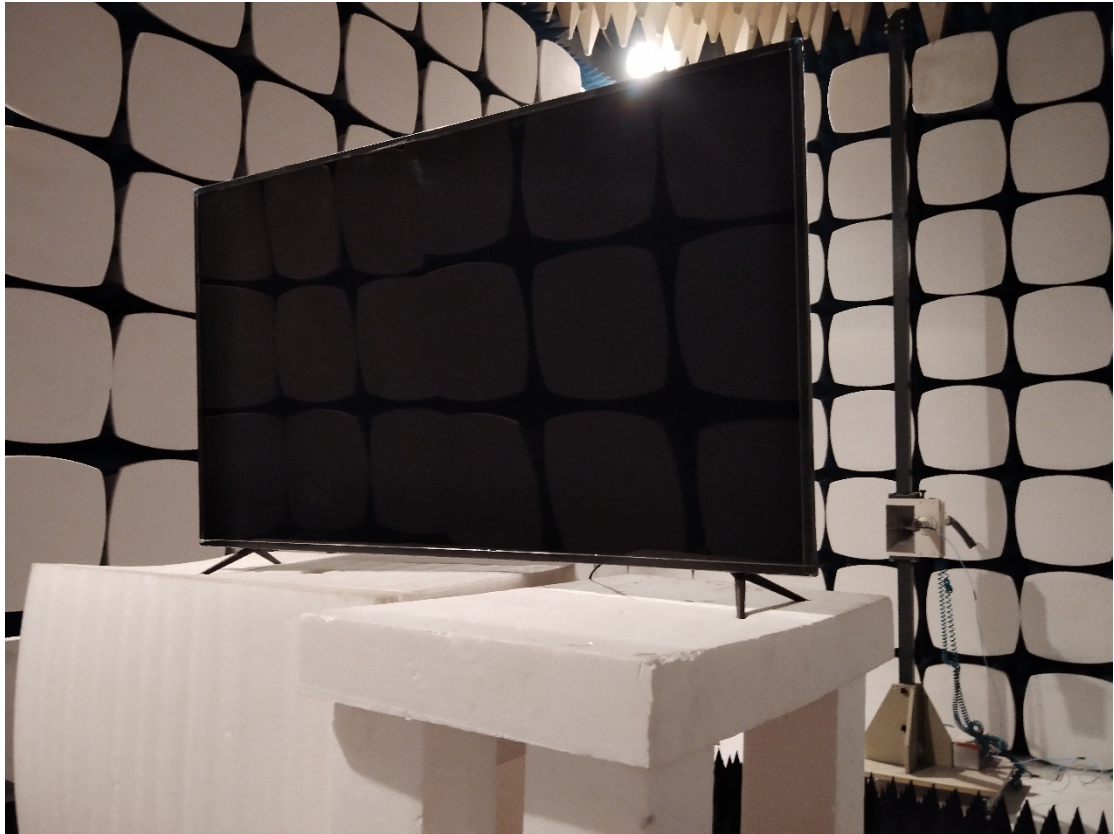
COMPLIANCE CERTIFICATION SERVICES (SHENZHEN) INC test above 1GHz emission