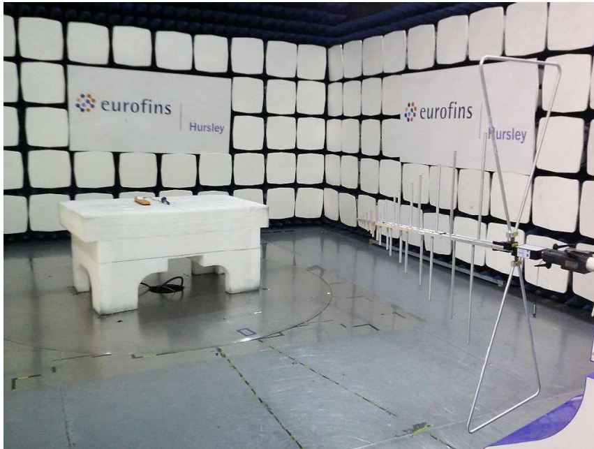
Radiated Emissions; Above 1 GHz