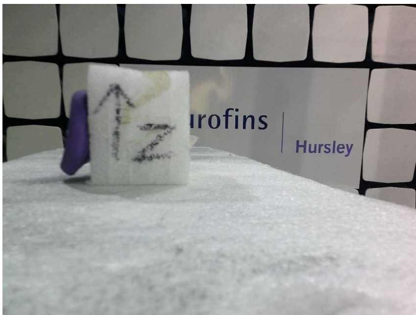
Radiated Emissions; Above 1 GHz