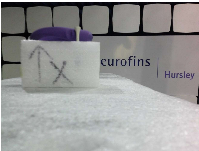
Radiated Emissions; Above 1 GHz