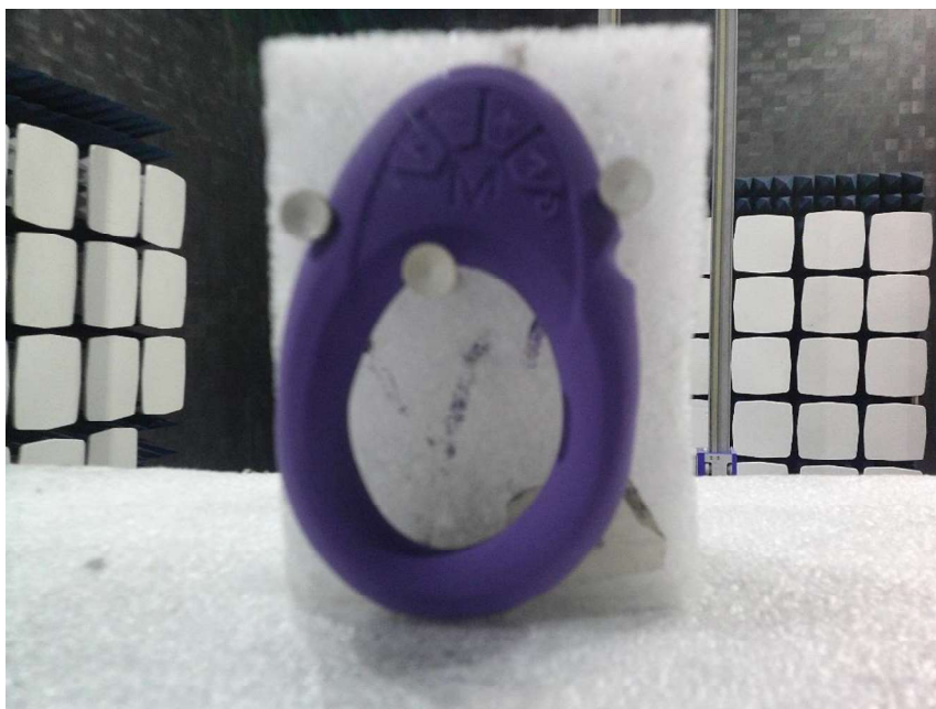
Radiated Emissions; Above 1 GHz