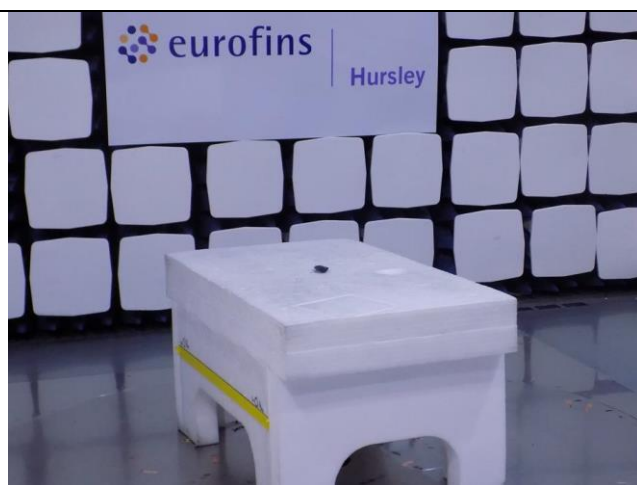
30 – 1000 MHz