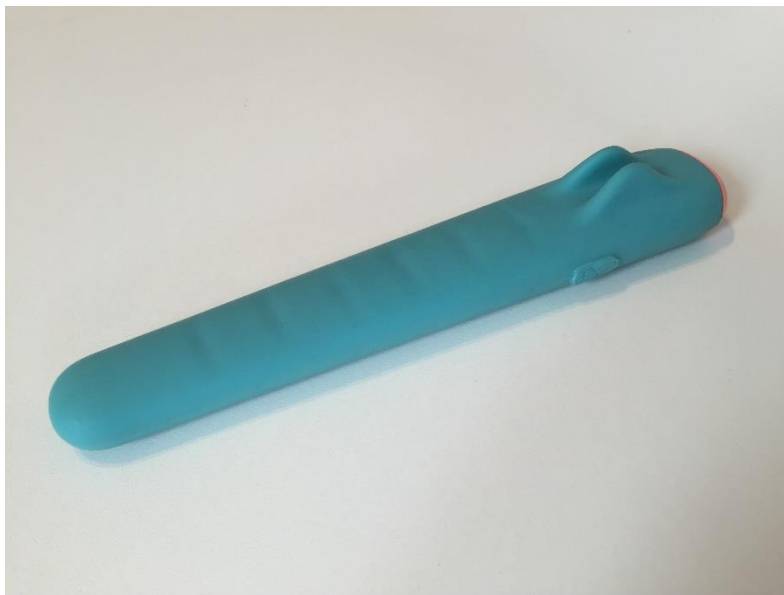
Figure 1 Crescendo Product