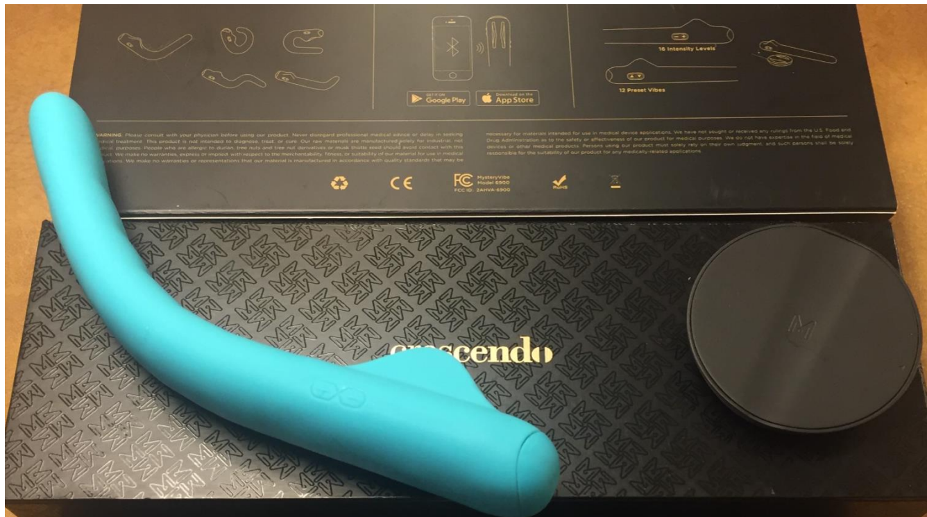
Figure 2 Crescendo Packaging with FCC ID