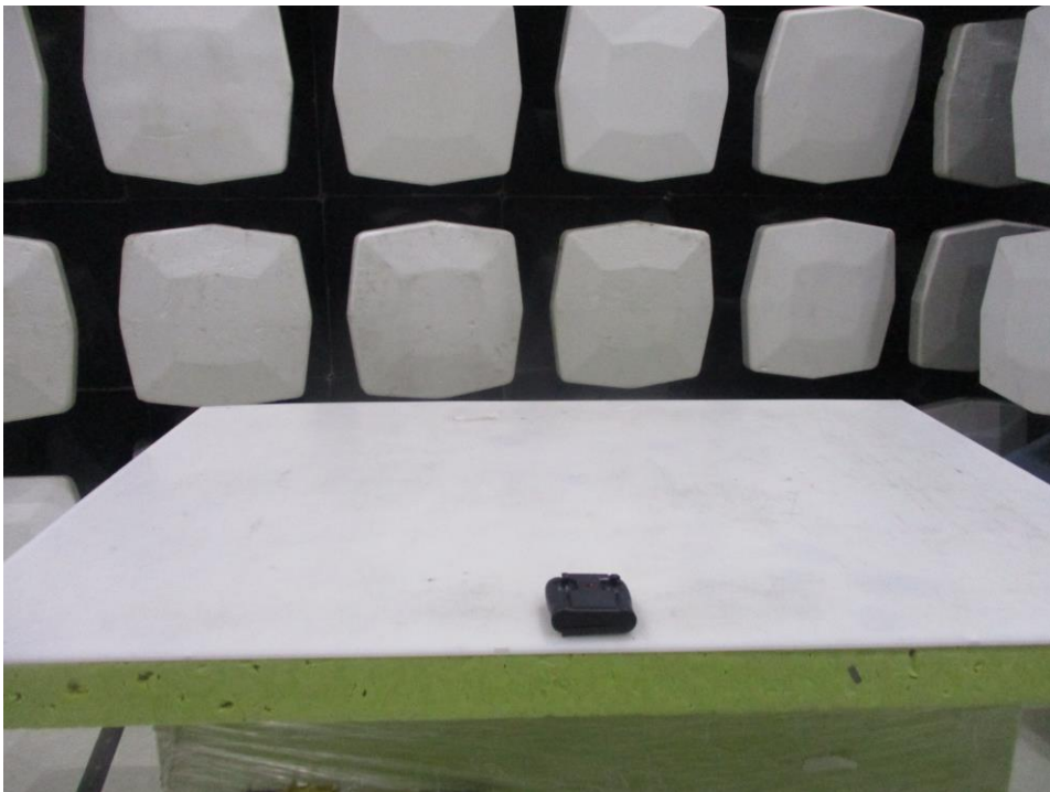
Up to 1GHz (EUT was placed in the centre of the turntable)