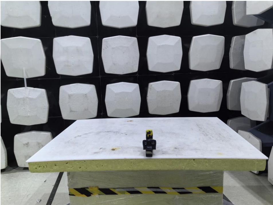
Up to 1GHz (EUT was placed in the centre of the turntable)