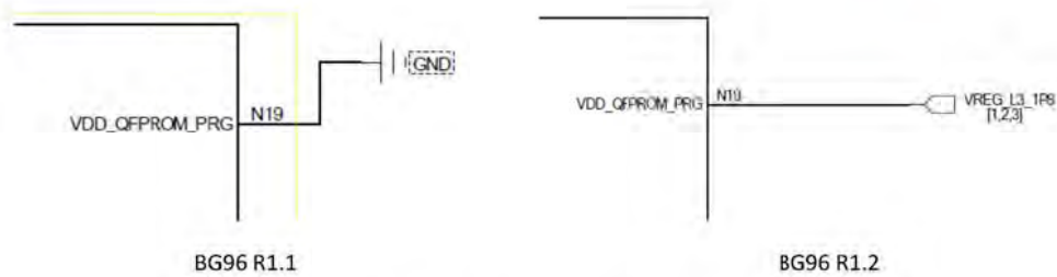
Figure 1: Schematic Designs of BG96 R1.1 and R1.2