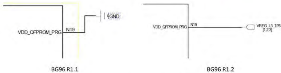
Figure 1: Schematic Designs of BG96 R1.1 and R1.2