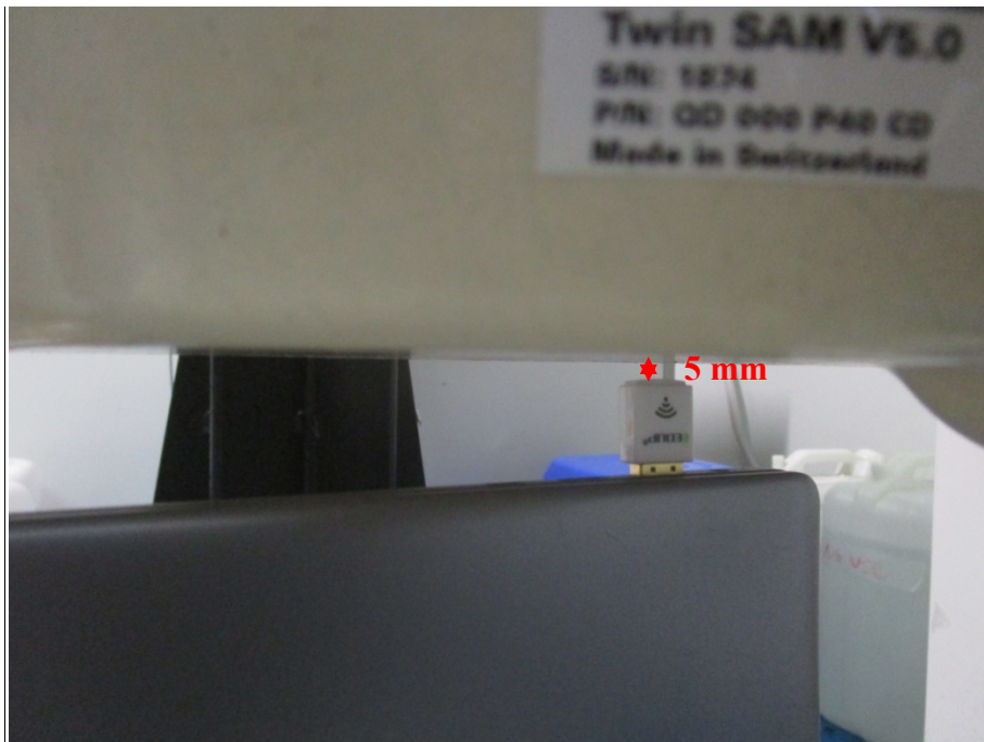
Horizontal-Down Setup Photo(5mm) _SAR Lab 1