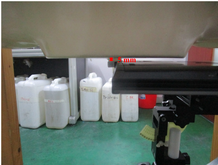
Horizontal-Up Setup Photo(5mm)_SAR Lab 2