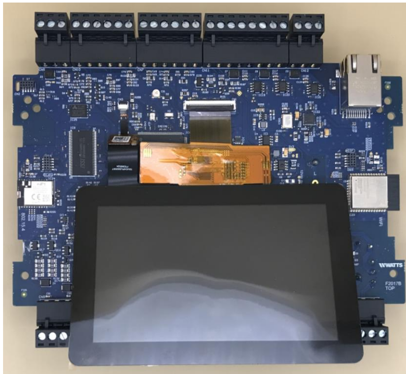
PCB with LCD assembly – Top side