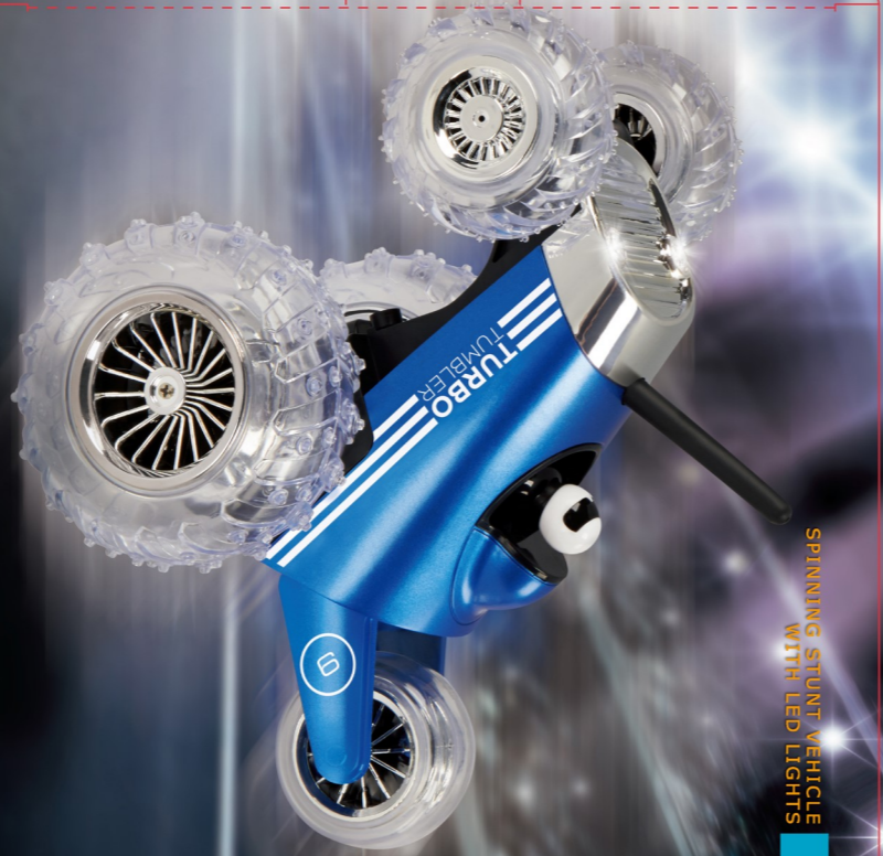
SPINNING STUNT VEHICLE WITH LED LIGHTS