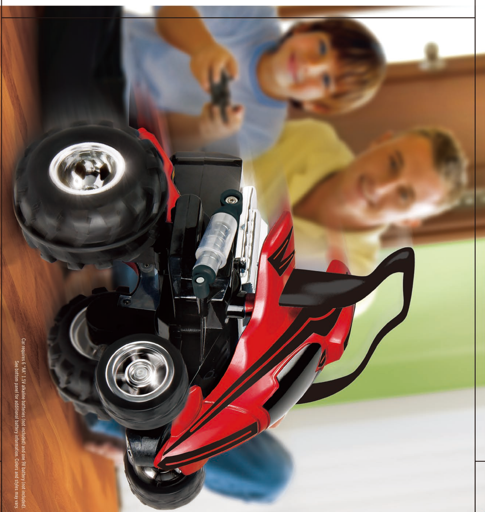
©2016 Mattel. All rights reserved. Street Savage is a registered trademark of Mattel. All other trademarks are the property of their respective owners.