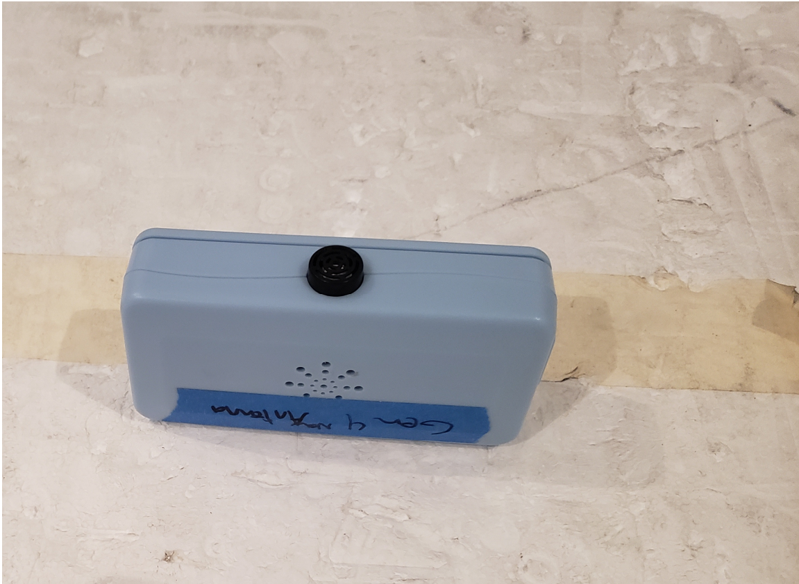
Figure 1. Radiated Emissions Test Setup, Intentional Testing