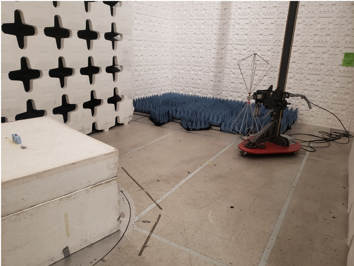
Figure 3. Radiated Emissions Test Setup, Intentional, 30 MHz to 200 MHz

FCC Part 15 Class 2 Permissive Change 2AHQD-SENSOR4 22-0199 August 1, 2022 Clean Hands Safe Hands, LLC Gen4 Sensor