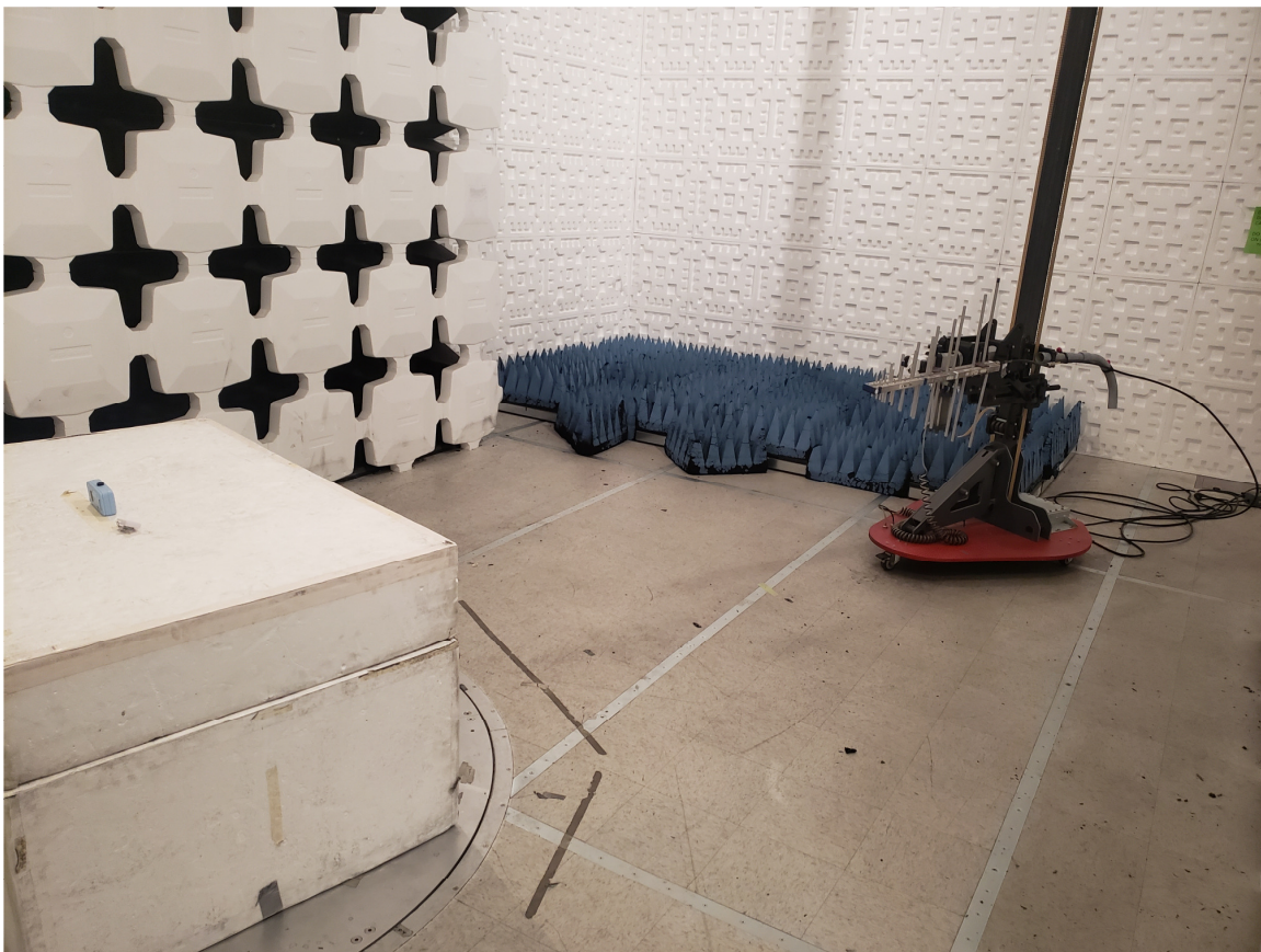
Figure 4. Radiated Emissions Test Setup, Intentional, 200 MHz to 1GHz

FCC Part 15 Class 2 Permissive Change 2AHQD-SENSOR4 22-0199 August 1, 2022 Clean Hands Safe Hands, LLC Gen4 Sensor