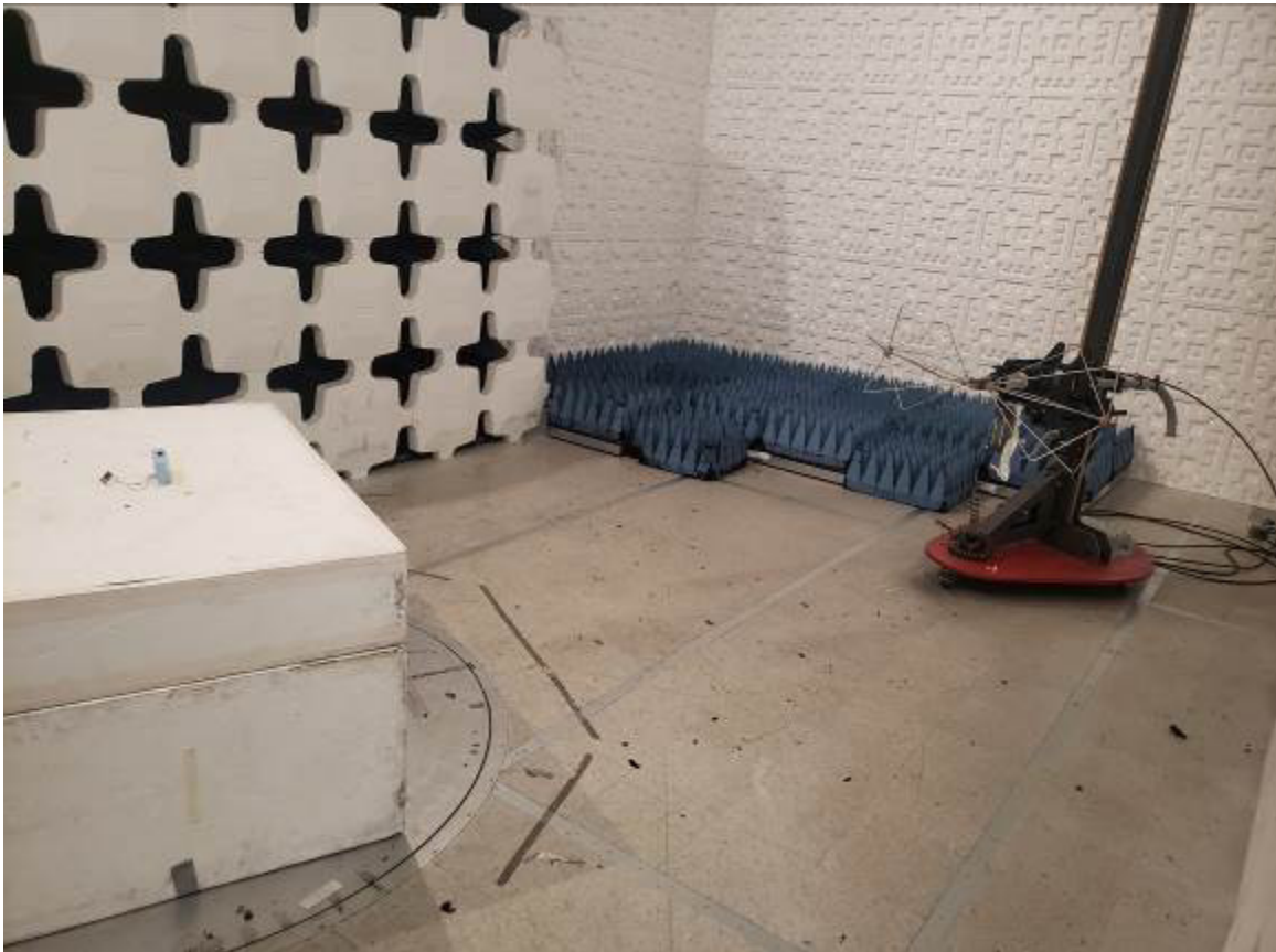
Figure 3. Radiated Emissions Test Setup, Intentional, 30 MHz to 200 MHz

FCC Part 15 Certification 2AHQD-SENSOR4 22-0125 June 6, 2022 Clean Hands Safe Hands Gen4 Sensor