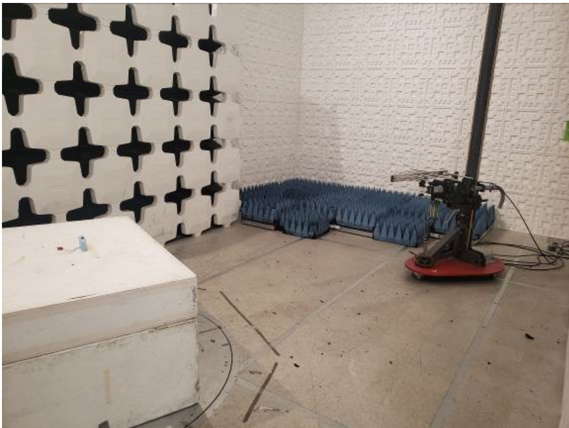
Figure 4. Radiated Emissions Test Setup, Intentional, 200 MHz to 1GHz

FCC Part 15 Certification 2AHQD-SENSOR4 22-0125 June 6, 2022 Clean Hands Safe Hands Gen4 Sensor