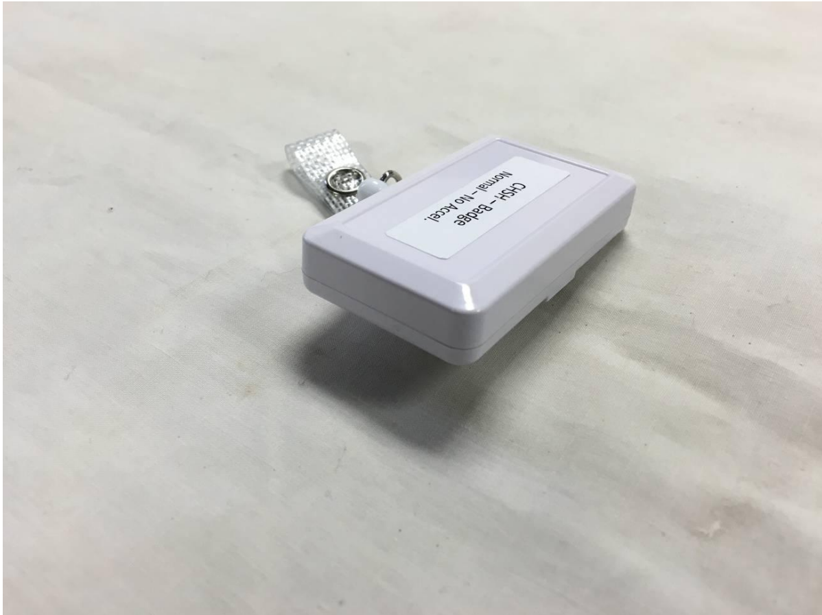
Figure 3. Side 1

FCC Part 15 Certification/ RSS 210 2AHQD-BADGE 16-0058 April 7, 2016 Clean Hands Safe Hands CHSH Badge