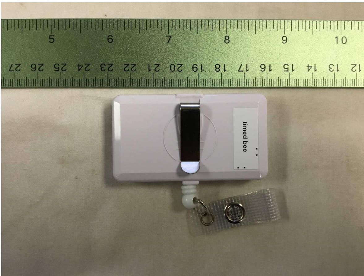
Figure 2. Back View

FCC Part 15 Certification/ RSS 210 2AHQD-BADGE 16-0058 April 7, 2016 Clean Hands Safe Hands CHSH Badge