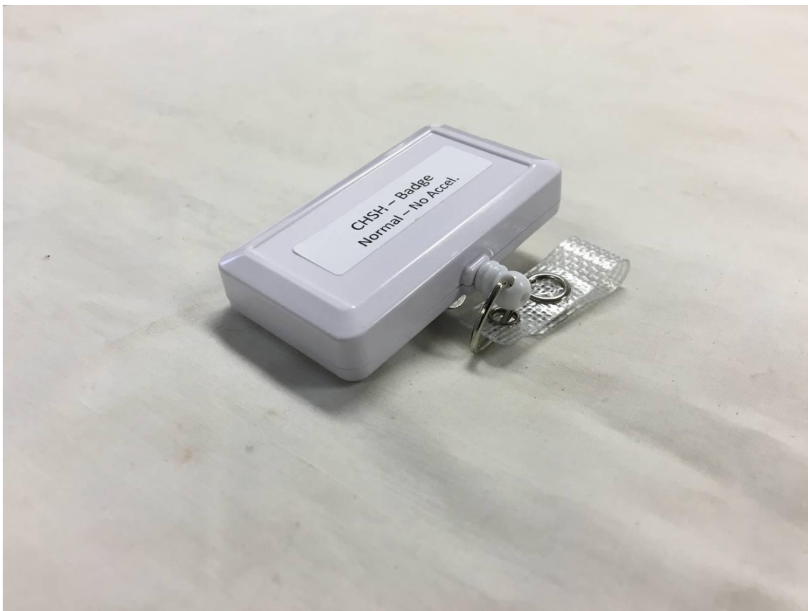
Figure 4. Side 2

FCC Part 15 Certification/ RSS 210 2AHQD-BADGE 16-0058 April 7, 2016 Clean Hands Safe Hands CHSH Badge