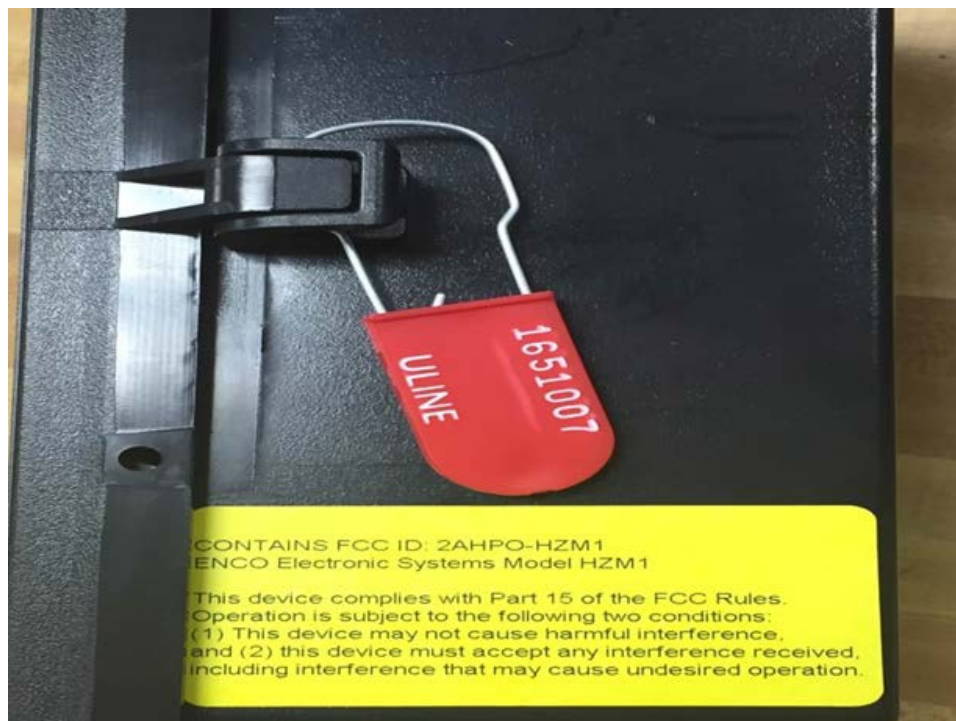
Figure 2: Host Sample Label and Location