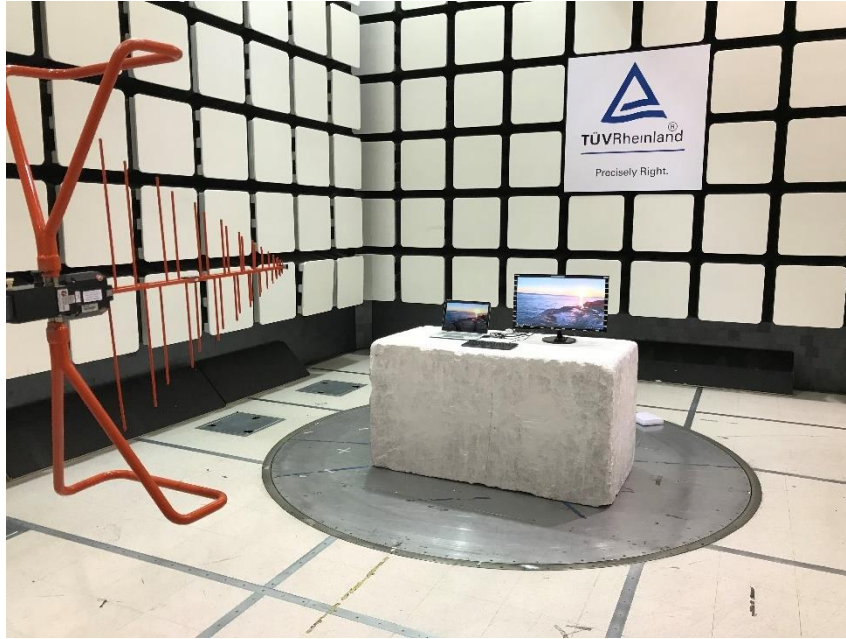
Figure 2: 30 - 1000 MHz Radiated Emissions Test Setup - Front