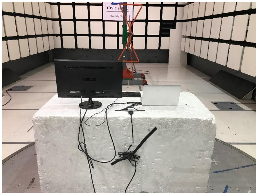
Figure 3: 30 - 1000 MHz Radiated Emissions Test Setup – Back

The test results contained in this report refer exclusively to the product(s) presented for testing. No liability may be assumed for models or products not referred to herein. This test report may not be published or duplicated in part without permission of the testing body. This test report by itself does not constitute authorization for the use of any TÜV Rheinland test mark. The report must not be used by the client to claim product certification, approval, or endorsement by A2LA.