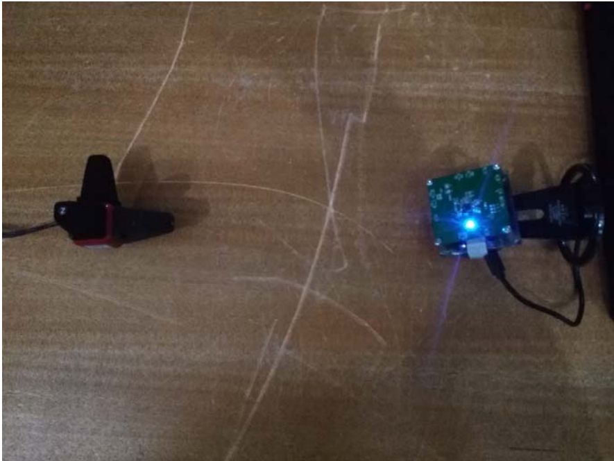
H-Filed Strength View