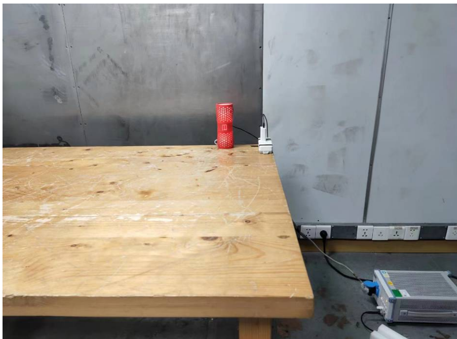
Photo of Conducted Emission Measurement