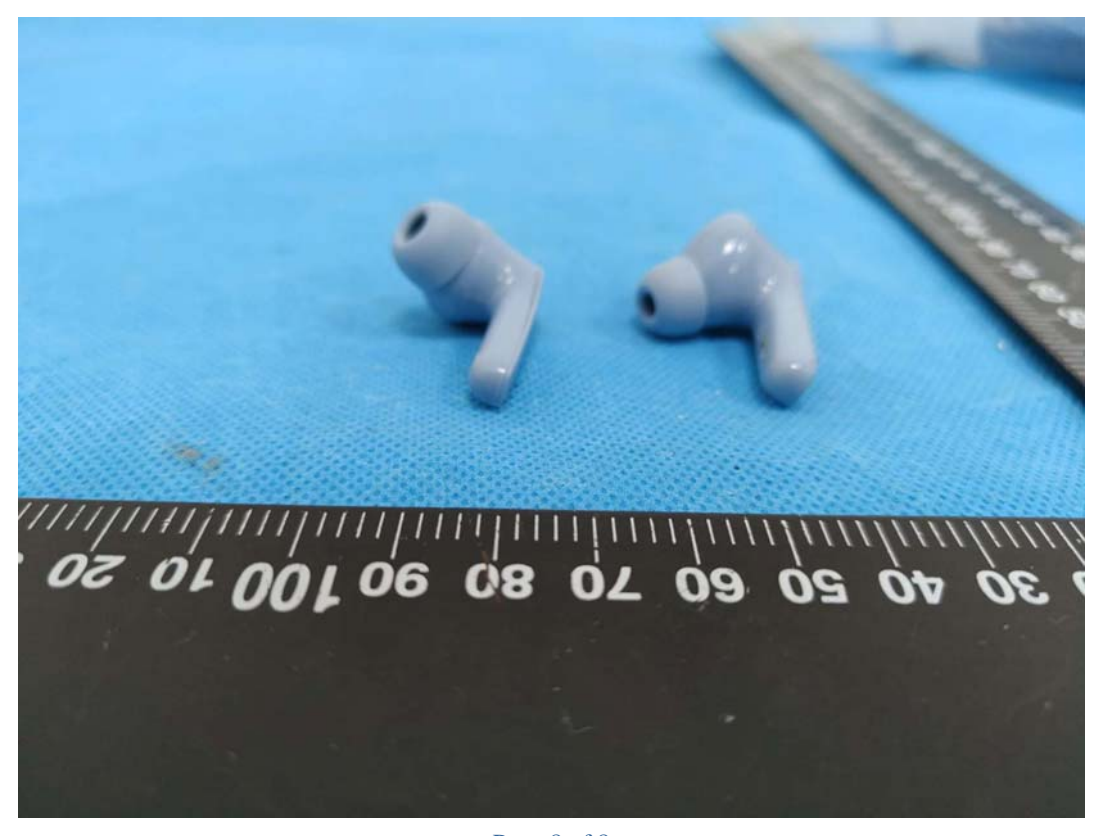
Page 8 of 8