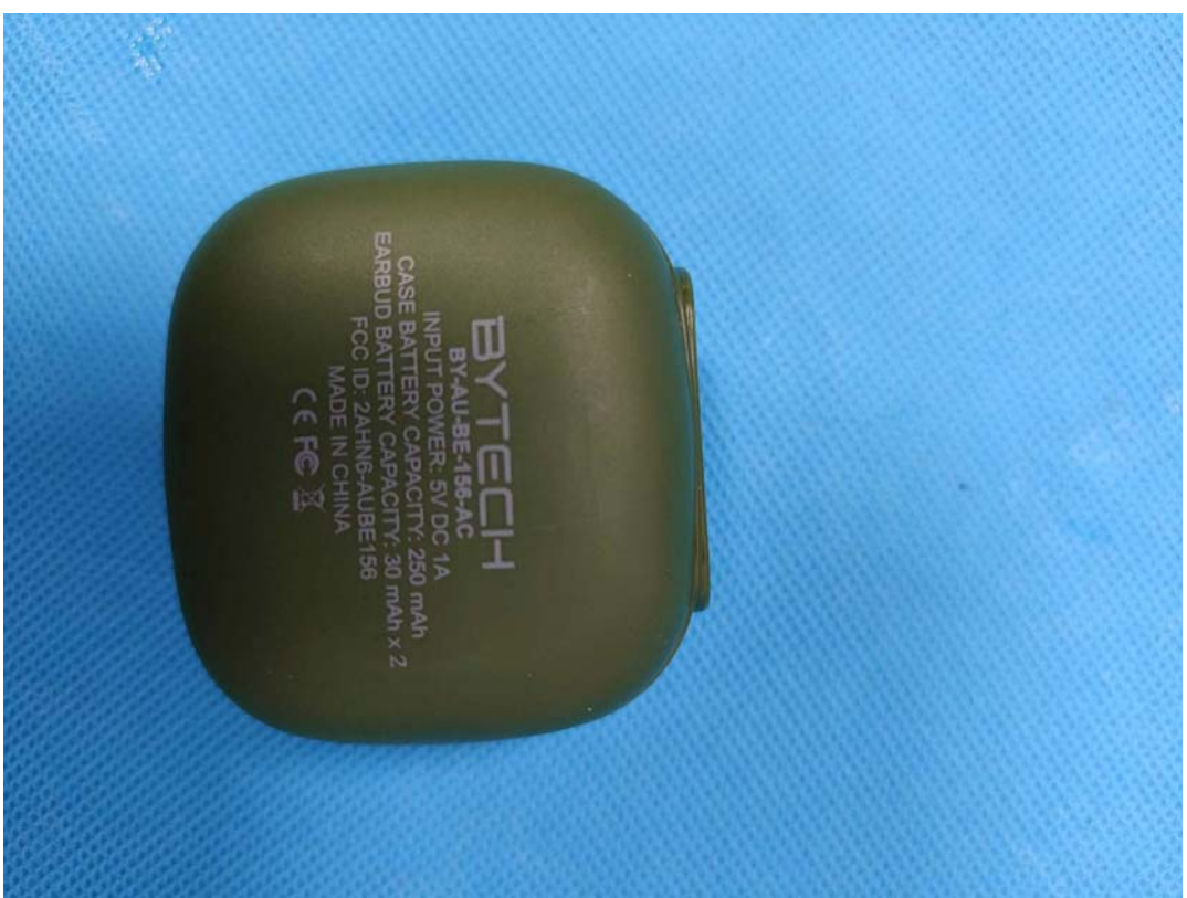
Page 4 of 8