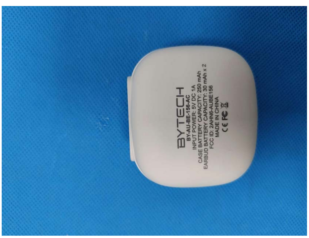
Page 3 of 8