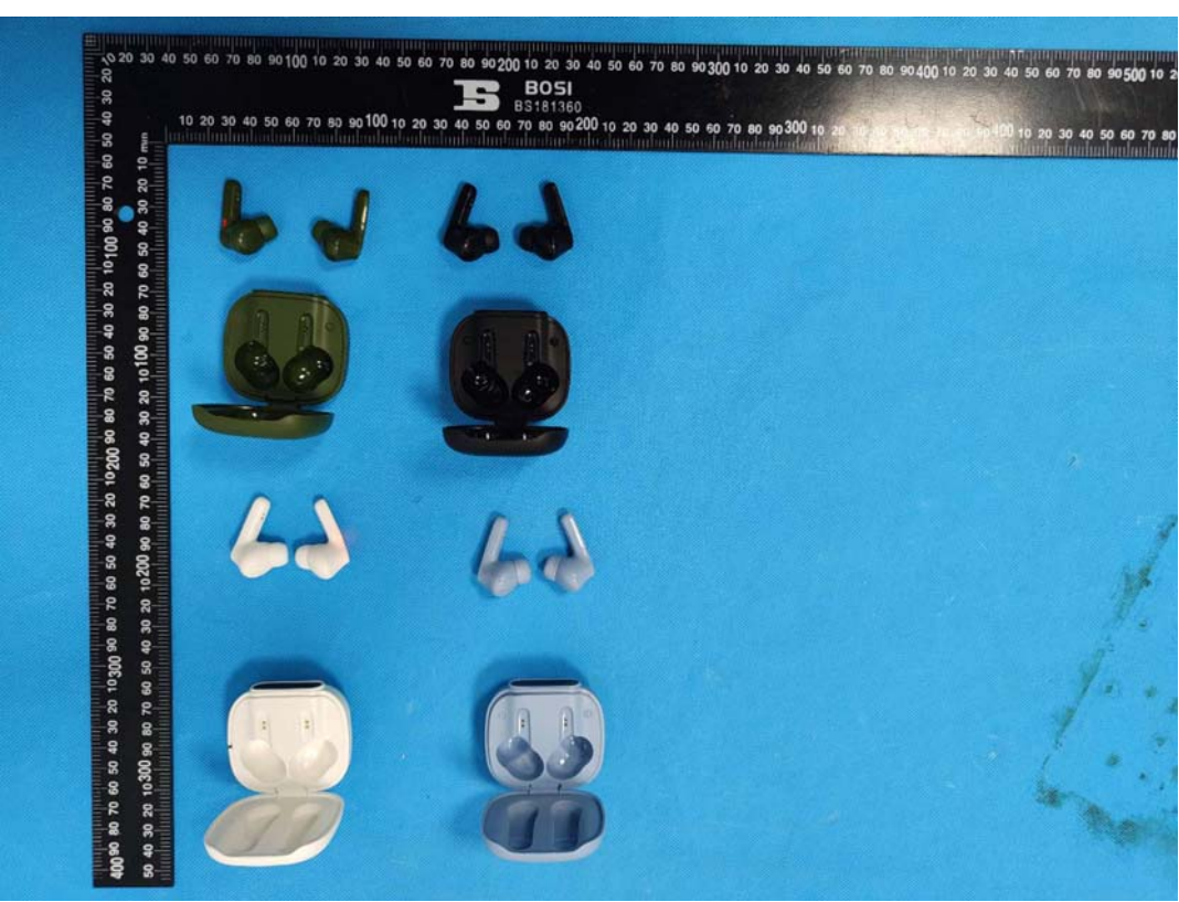
Page 1 of 8