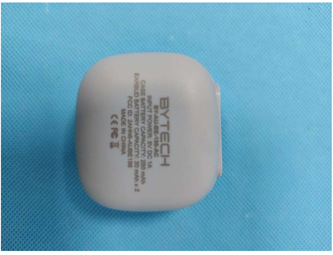
Page 5 of 8