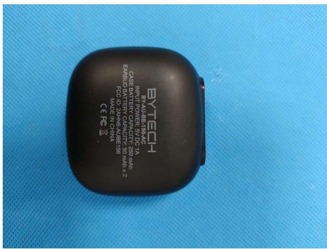
Page 2 of 8