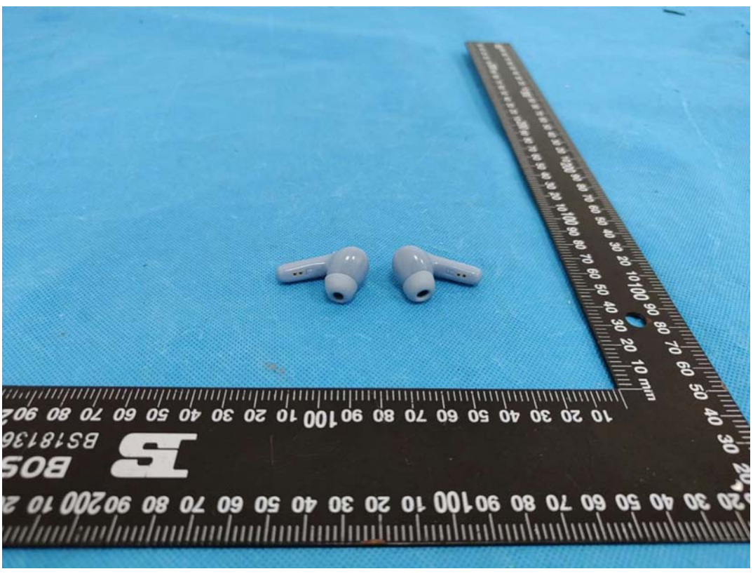
Page 7 of 8