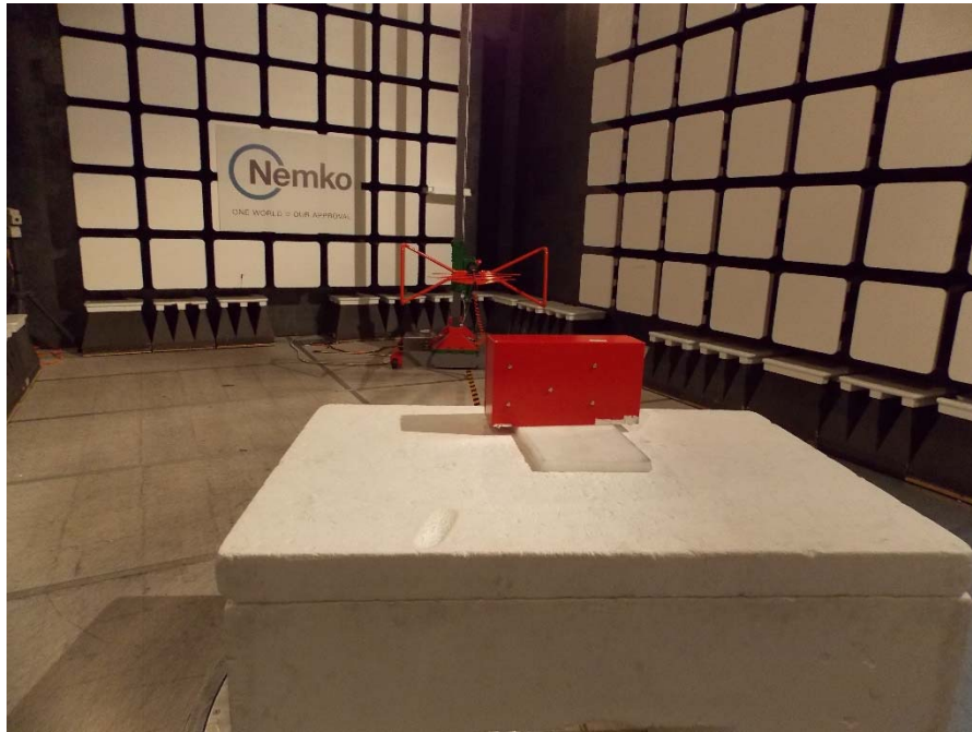
Radiated spurious (out-of-band) emissions setup photo – 30 to 1000 MHz