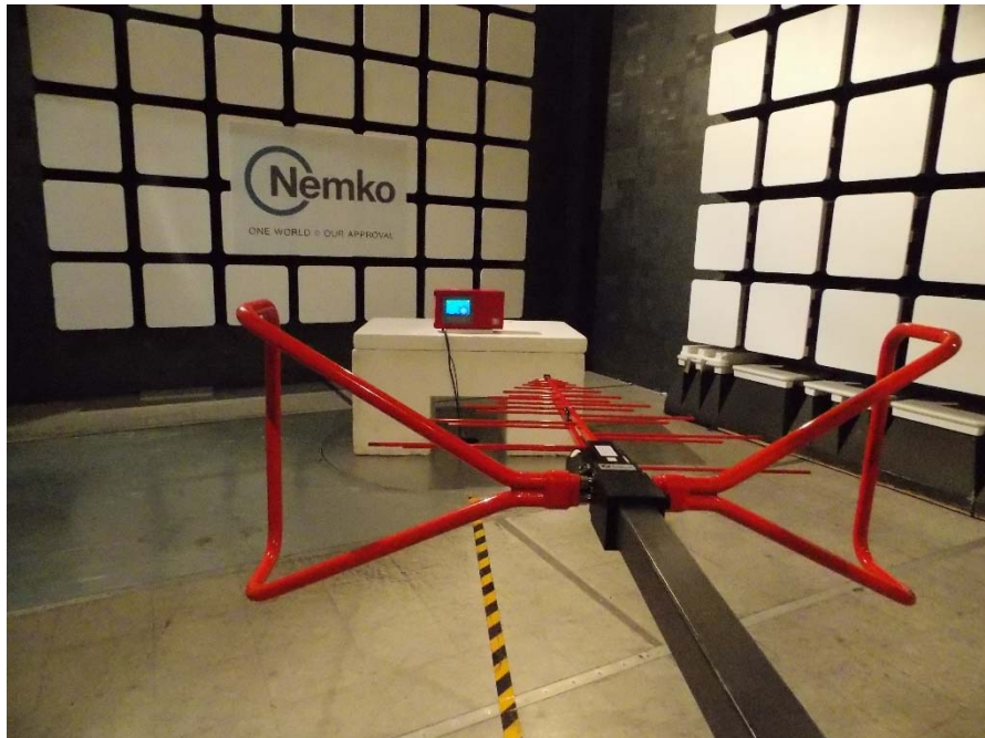
Radiated spurious (out-of-band) emissions setup photo – 30 to 1000 MHz