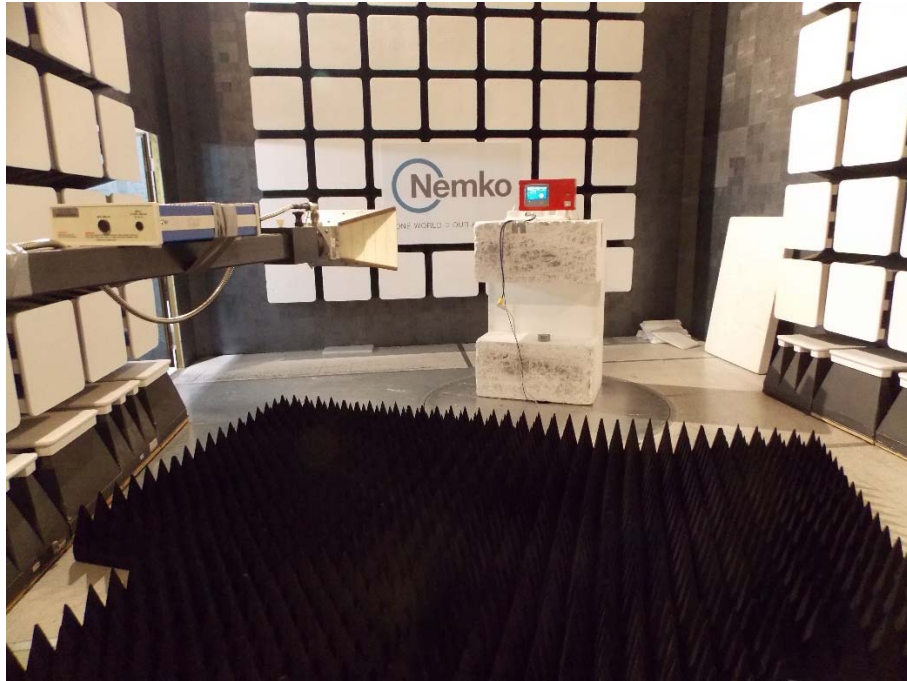
Radiated spurious (out-of-band) emissions setup photo – above 1 GHz