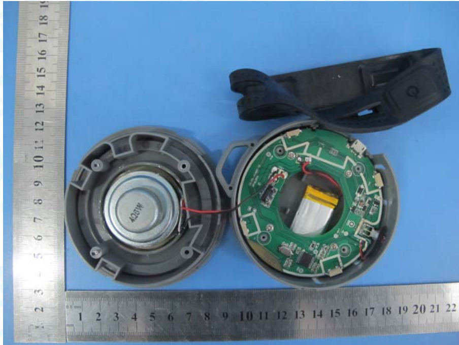
Photo 6 Appearance of PCB