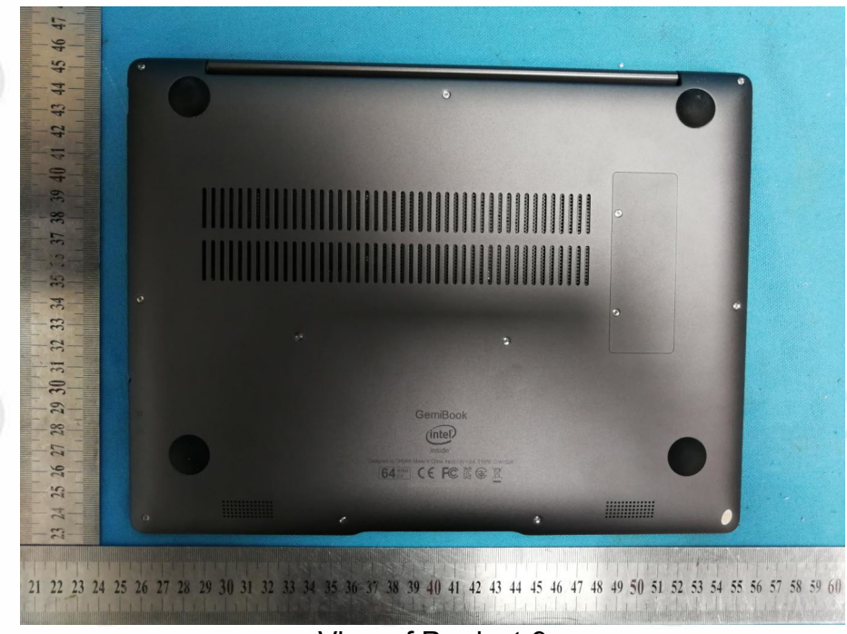
View of Product-9