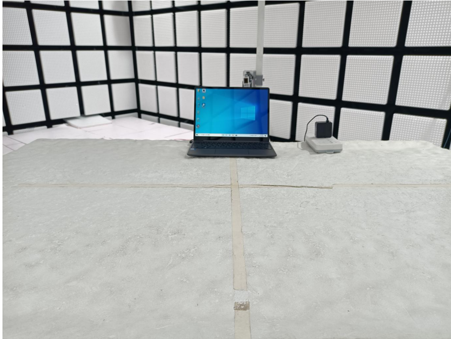
Radiated spurious emission Test Setup-4(Above 18GHz)