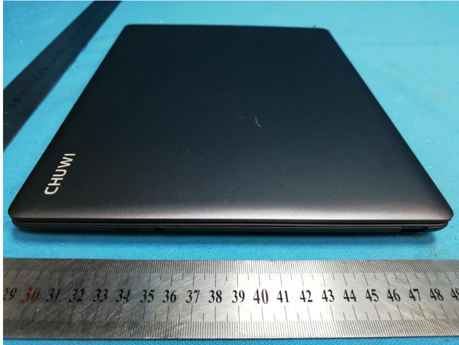
View of Product-7