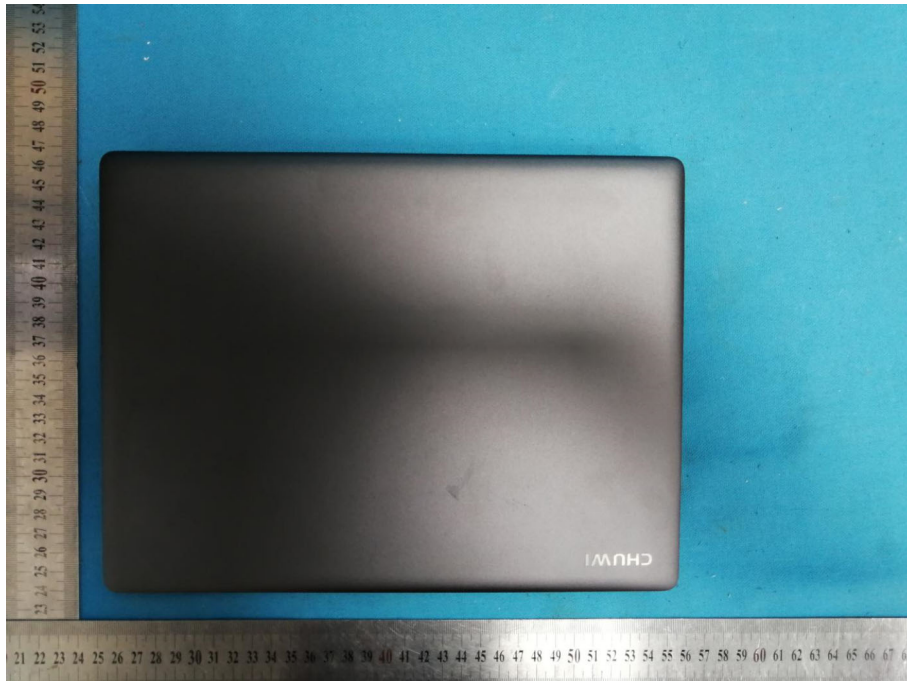
View of Product-2