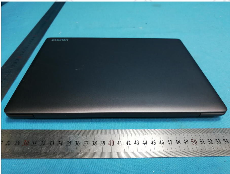
View of Product-6