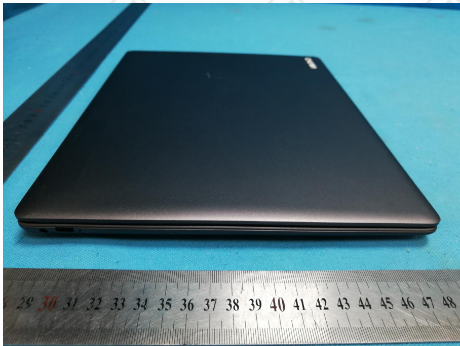
View of Product-4