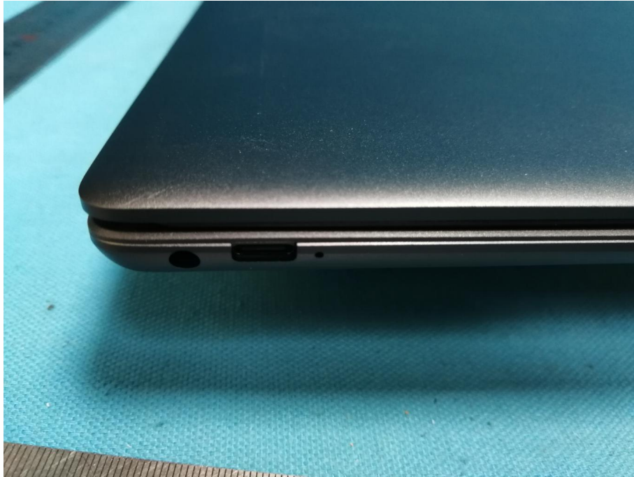
View of Product-5