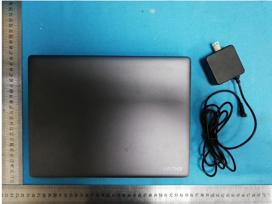
View of Product-1