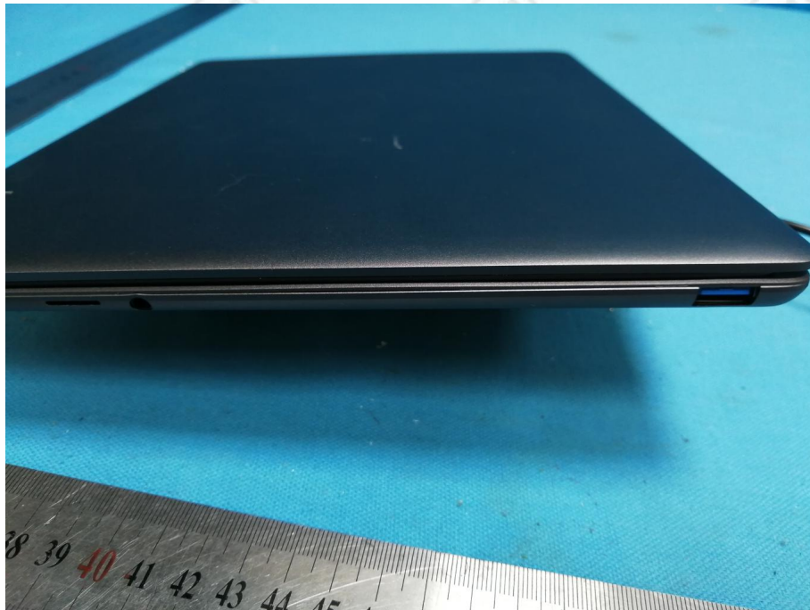
View of Product-8