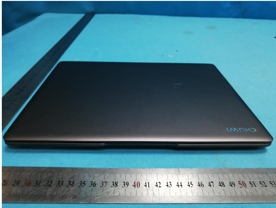
View of Product-3